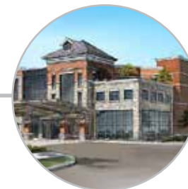
5 | Bone and Joint Institute