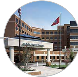
2 | Williamson Medical Center