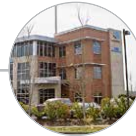
3 | Physicians Urgent Care