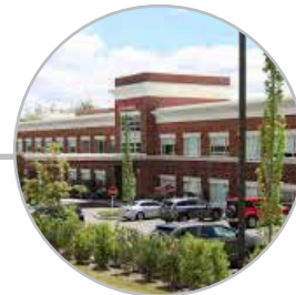
4 | Encompass Health Rehabilitation Hospital