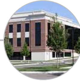
1 | Vanderbilt University Medical Center